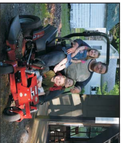
Thank-you to those who paid for the new Ferris Zero Turn mower.